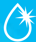
Granular Activated Carbon Filter