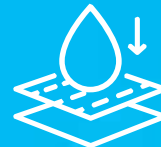
0.0001 Micron Membrane Reduces inorganics, TDS, dissolved metals, arsenic