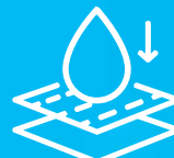
0.0001 Micron Membrane Reduces inorganics, TDS, dissolved metals, arsenic